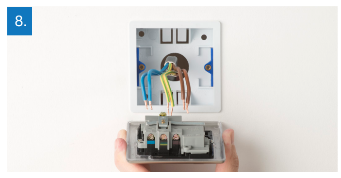
Line up the new socket and take note of where each terminal is located.