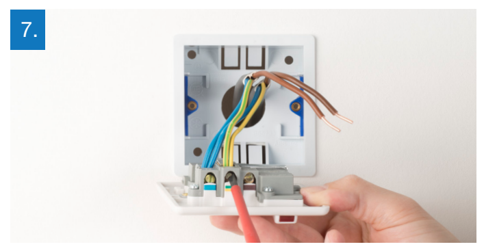
Whichever wiring configuration you find, unscrew each terminal screw to release the wires. You should now be able to remove the socket and place it to one side.