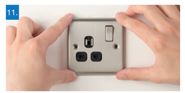
Gently press the socket back into place over the mounting box. Take care not to trap any wires between the wall and the socket.