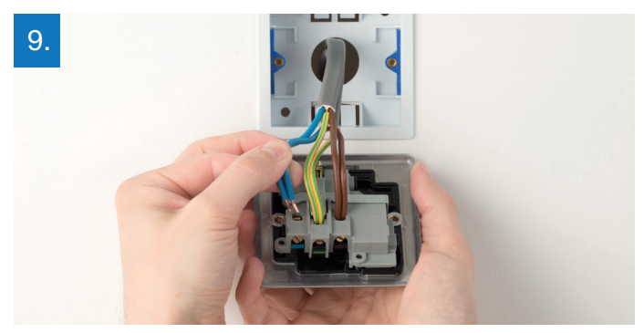
Place the blue wire(s) into the neutral terminal, brown wire(s) into the live terminal and the green/yellow wire(s) into the earth terminal. The terminals on the socket are colour-coded to help locate the correct one.