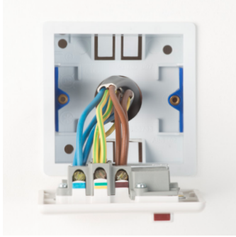
Alternatively, there could be two or three wires of each colour connected to each terminal.