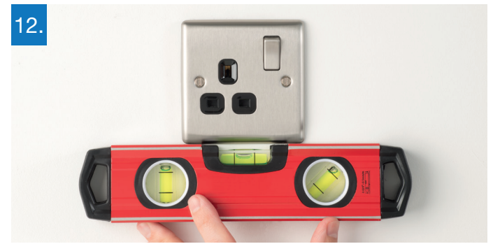
Insert and tighten the retaining screws provided. Use a spirit level to make sure that the socket is level. Restore the power at the consumer unit and test.