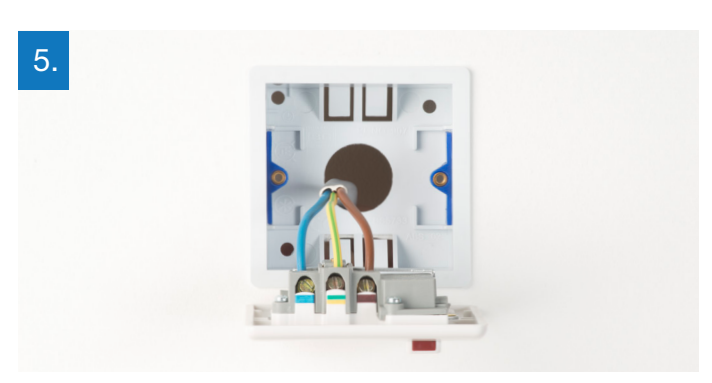
There will generally be three different wiring configurations. This photo shows a single wire of each colour connected to each terminal.